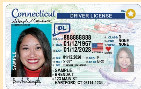
Horizontal driver's license

Retailers can make a preliminary verification of age by looking at the orientation of the customer's driver's license (vertical vs. horizontal) when selling tobacco products and/or e-cigarettes.